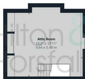
Floor 2 Building 1